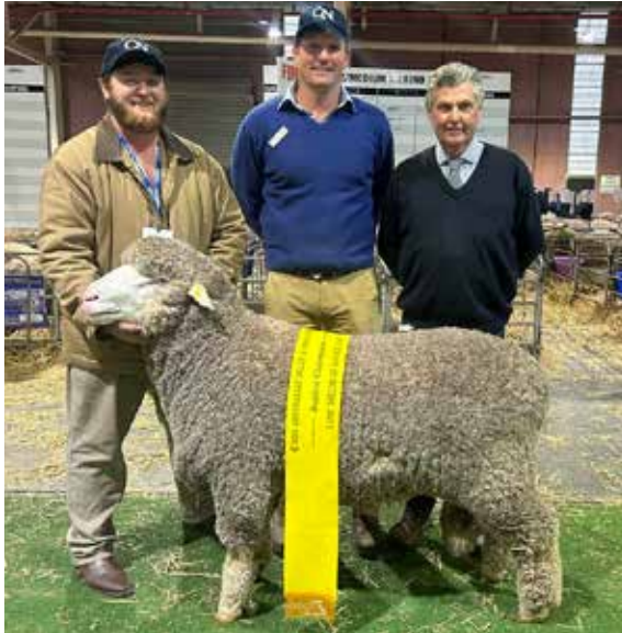
Yellow 530 Reserve Junior Champion. Australian Sheep & Wool Show 2023