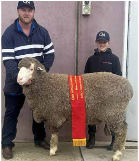
Lot 2 on property auction. Black 12 Reserve Champion March Australian Sheep & Wool Show