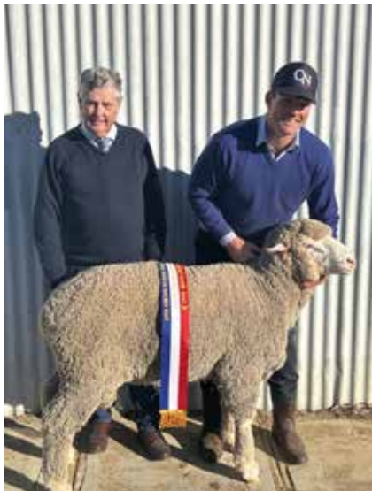
Green 20 - Champion Strong Wool March Shorn 2023 Hay NSW - 2nd EP Ram of the Year

Arrangements can be made with the vendor for rams not delivered on the day of sale to be retained free of charge at “Collandra North” until transport is arranged. Every care and attention will be given to these sheep, but they will be at the purchaser’s risk.