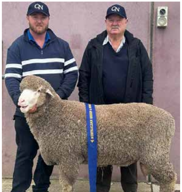
Lot II Pink II First in the fine medium 2 tooth Class. Australian Sheep & Wool Show Bendigo 2024