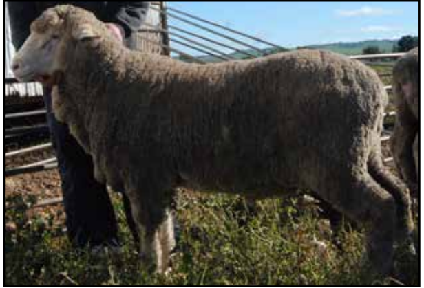
Collandra North White 2