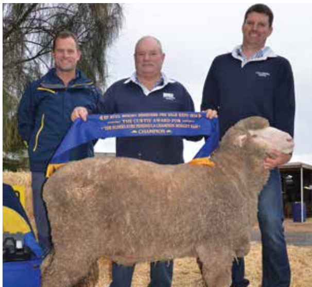
BLACK 243 - WINNER OF 2016 SA EP RAM OF THE YEAR WINNER OF 2016 MEDIUM WOOL - 2 tooth class - Hay NSW

Arrangements can be made with the vendor for rams not delivered on the day of sale to be retained free of charge at “Collandra North” until transport is arranged. Every care and attention will be given to these sheep, but they will be at the purchaser's risk.