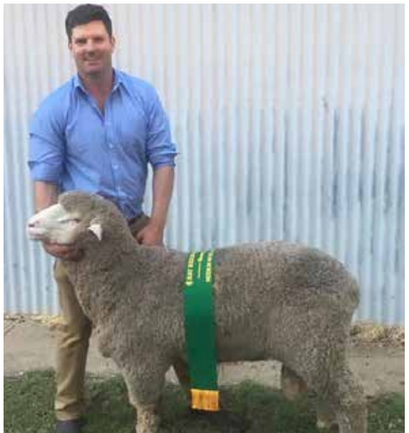
White 35 Hay Merino Sheep Show 2019 Medium Wool March Shorn Ram Reserve Champion, Winner of 2019 EP Ram of the Year