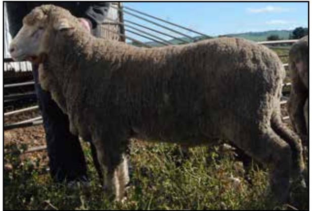
Collandra North White 2