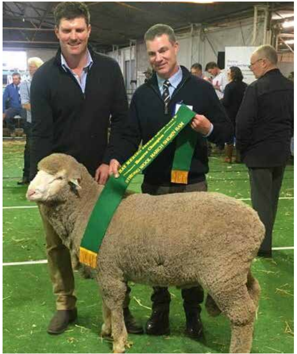
Green 35 Hay Merino Sheep Show 2019 Strong Wool March Shorn Ram Reserve Champion